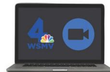
WSMV Live Newscasts May 7, 2024 @ 10PM