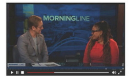
News Channel 5 MorningLine - Nick Beres